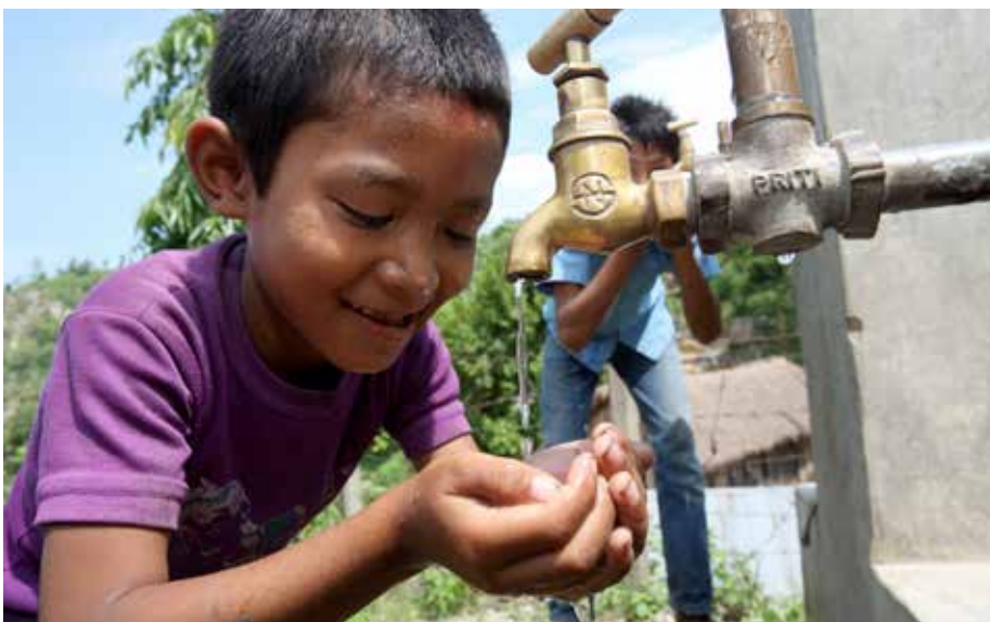
900 million people suffer from a lack of clean drinking water. During the NEWAW WASH-project taps were installed in Puware Shikhar, Nepal.

“The ETVAX vaccine contains a number of components: killed ETEC bacteria, so-called colonisation factors that allow the bacteria to reproduce in the intestine, and detoxified LT toxin and an adjuvant