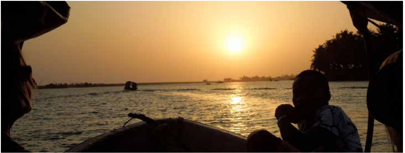
omo is a border river between Benin and Togo.