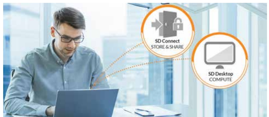
CSC can install new software on CSC’s computing environment SD Desktop at the researcher’s request.

“Patients with dermatitis herpetiformis have antibodies to transglutaminase 2, but they also have antibodies to a related enzyme, transglutaminase 3. Transglutaminase 3 (TG3) antibodies are also found in the skin, close to the rash, and are thought